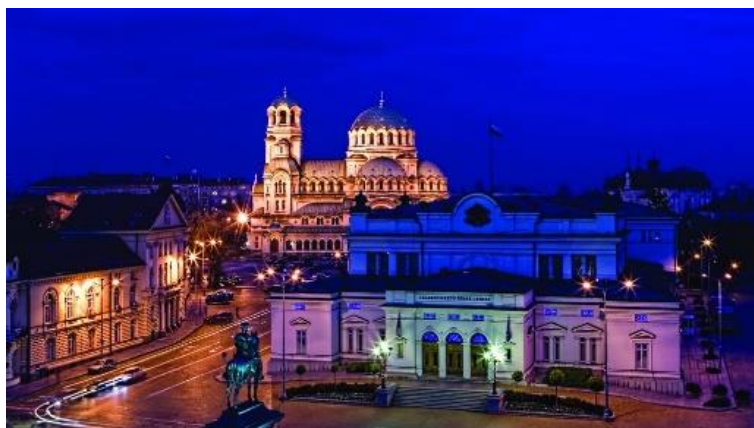
A view of the emblematic Alexander Nevski Cathedral and the Parliament

A view of Sofia by night, from the nearby beautiful Vitosha Mountain